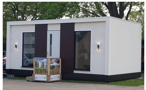
We can incorporate a range of external finishes

For more information contact: 08456 449003 | www.beattiepassive.com