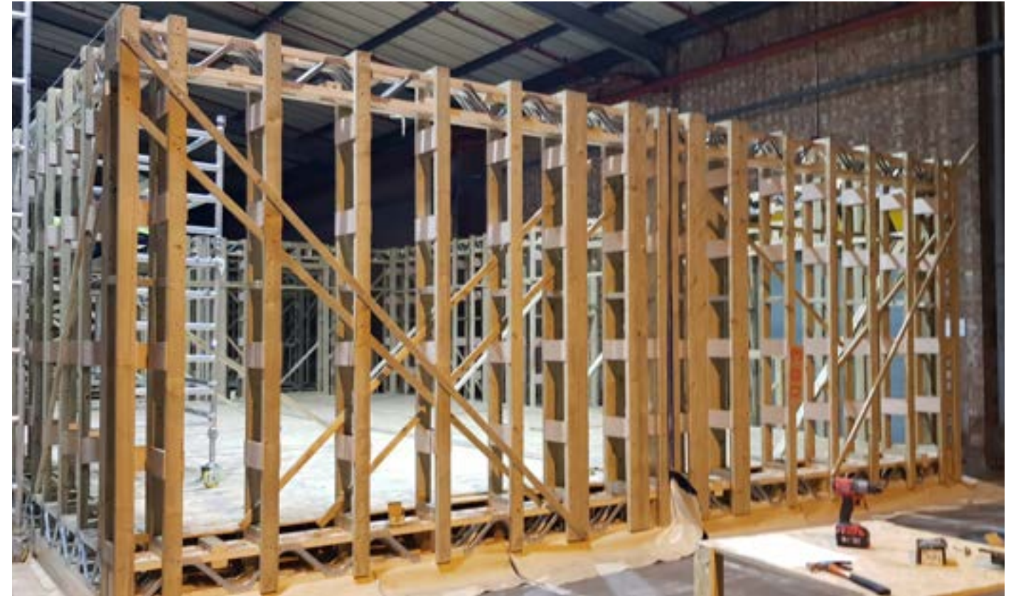
Above: our patented Passivhaus certified timber frame build system.

"We use timber because it has the lowest embodied carbon of any mainstream material"